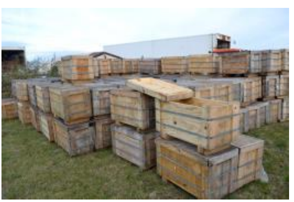
sheets and metal hutches

2.7 Now though, the design has been modified still further (see Figure 5). Mr Kerry advises: