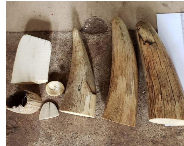
Image 5: Seized raw ivory from the factory raid (March 2020) © Wildlife Alliance.

The Wildlife Justice Commission disseminated an intelligence package to the Wildlife Rapid Response Team (WRRT) 5 who in collaboration with a deputy prosecutor of Phnom Penh, raided the factory premises in early March 2020 and arrested seven suspects: five Chinese and two Cambodian nationals. The raid also led to the confiscation of seven pieces of raw ivory and 36 pieces of worked ivory, as well as tiger bones, pangolin scales and dead seahorses.