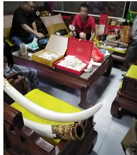
Image 4: Processed ivory products and tusks decorated with gold, offered to the Wildlife Justice Commission

During the visit , the Wildlife Justice Commission investigators were also offered a pair of large, decorated raw ivory tusks, which were being stored on site (Image 4).