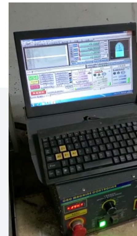
Images 1, 2 and 3: Ivory carving machines observed in the factory in Phnom Penh