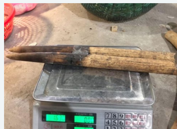
Image 7: Ivory tusks offered to Wildlife Justice Commission operatives, May 2020

to target and close the retail outlets and hubs that continue to facilitate this illegal trade before travel restrictions are lifted.