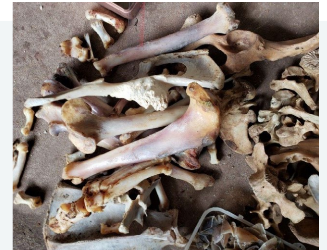
Image 6: Seized tiger bones from the factory raid (March 2020) © Wildlife Alliance.

Following further investigation, only one Chinese national was prosecuted under Article 98 of the Forestry Law (punishable with 1 to 5 years in prison and/or a fine of 10 million KHR (USD 2,500) to 100 million KHR (USD 25,000)) for possession and processing of endangered wildlife specimens, and was sent to pre-trial detention at the Prey Sar prison in Phnom Penh 6 .