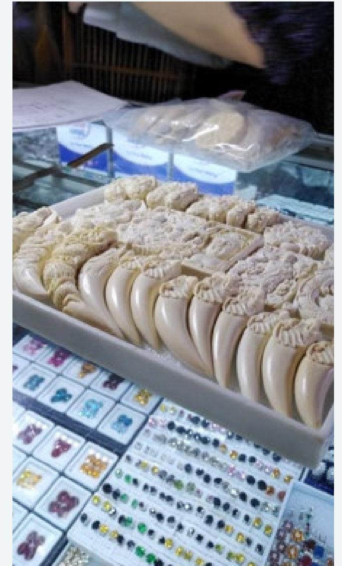
Ivory items on display in Phnom Penh and Sihanoukville.