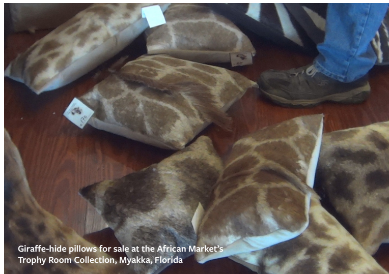
Giraffe-hide pillows for sale at the African Market's Trophy Room Collection, Myakka, Florida