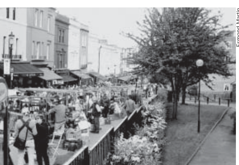
The shops and stalls on Portbello Road in London have the greatest variety and number of ivory items offered for sale in the UK.

The most common ivory items seen for sale in London were jewellery (22%), human figurines (12%), netsukes (10%) and walking sticks with ivory handles