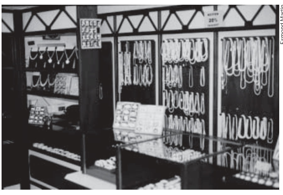
The ivory jewellery in this Erbach shop is well carved, but discounts are offered because there are not many interested clients except during Chistmas and summer holidays.

The elephant ivory carvers use a minimum of 300 kg a year.