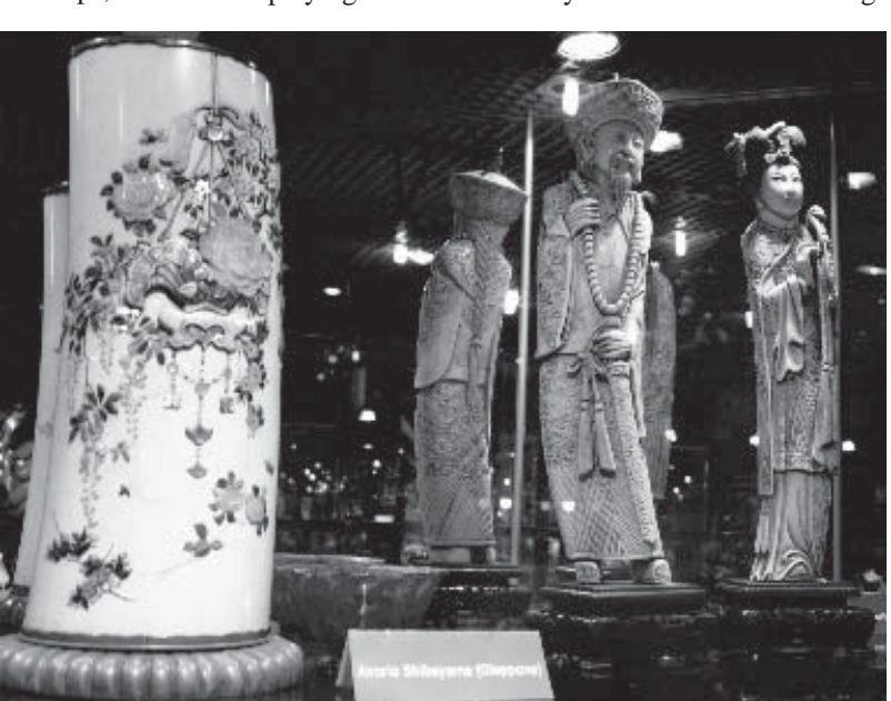
East Asian ivories were for sale in Milan's Central Railway Station.

In the four cities visited, 61 outlets were found displaying 461 worked ivory items for sale. These fig-