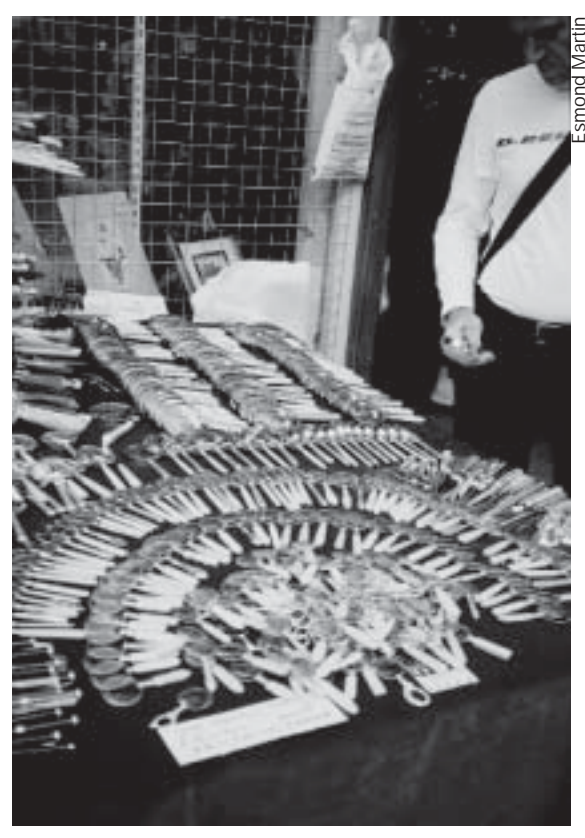
Old magnifying glasses with ivory handles displayed at a street stall on Portbello Road are among the most popular ivory items bought by tourists.

(8%). Of these items, 46% had been made in the UK, 27% in Japan, 15% in China and 12% elsewhere.