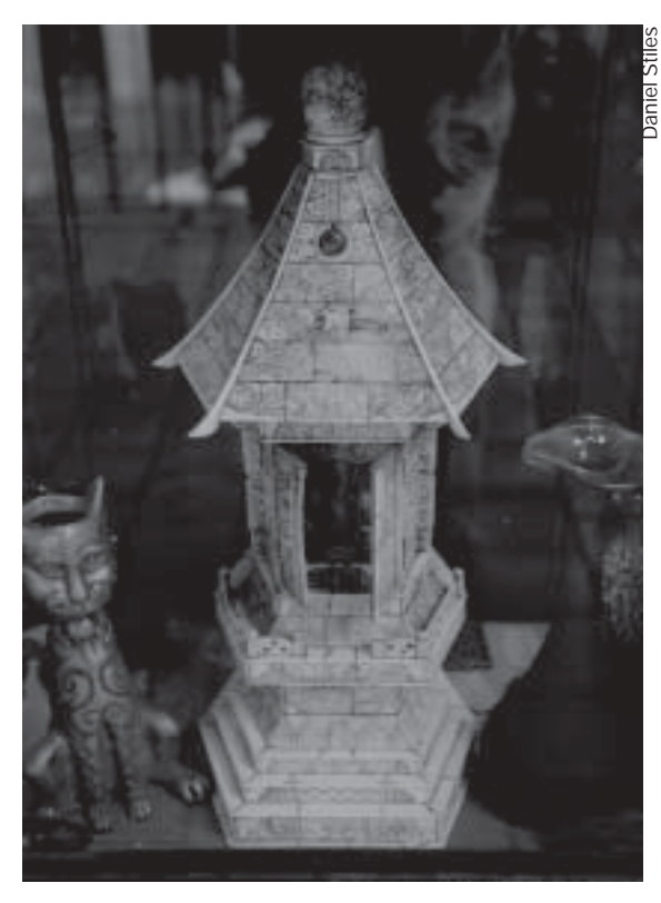
This Indian temple was for sale in a Madrid antique shop.

the city has many gift and souvenir shops, but of 26 visited, none contained ivory.